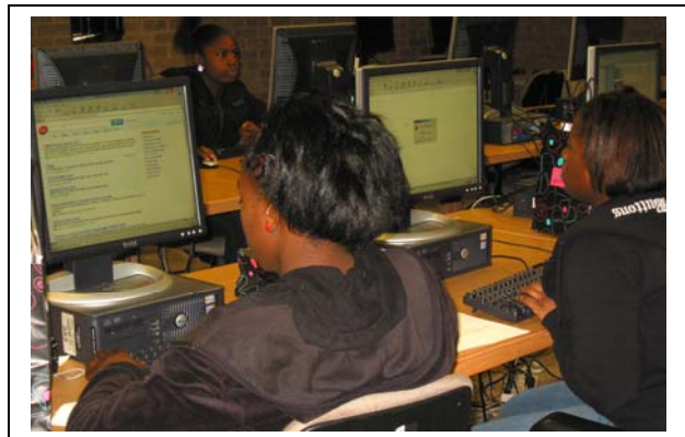
Finding Information on the Internet- taught by UNT / Dallas Library Assistants